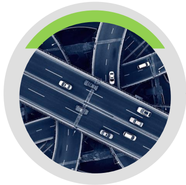
ROADS AND HIGHWAYS